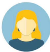
Rita Melis - Researcher-